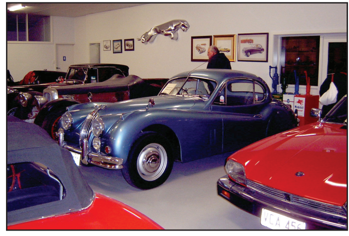
Carl Lindner's car showroom in Tanunda houses one of Australia's most impressive collection of Jaguar cars.

At all of these events, different members shared travel and joined in the activities. We had a lot of fun doing them and learned something new about each other away from