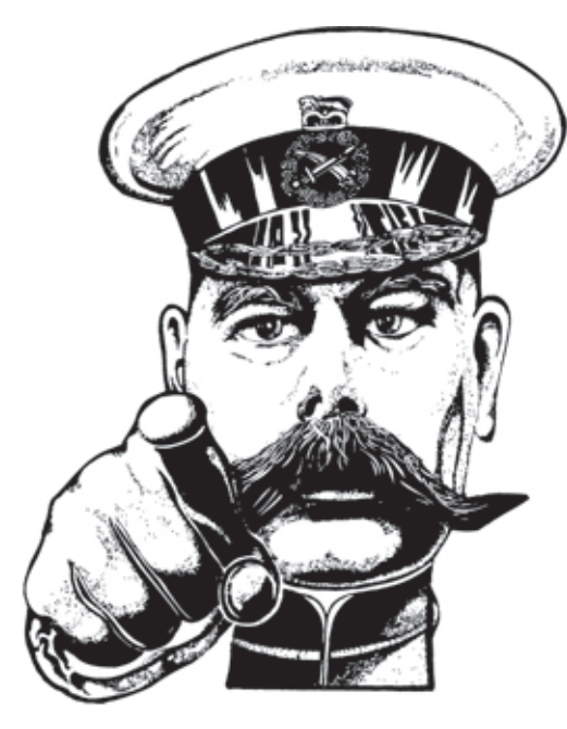
YOUR HELP IS NEEDED TO ENSURE A STRONG SUPPORT GROUP!

This group's recommendations will be presented to the full support group at the first meeting for 2014, on February 27. This is YOUR group – and you will have a big say in its future direction and function – so please make every effort to attend this Annual General Meeting, and to