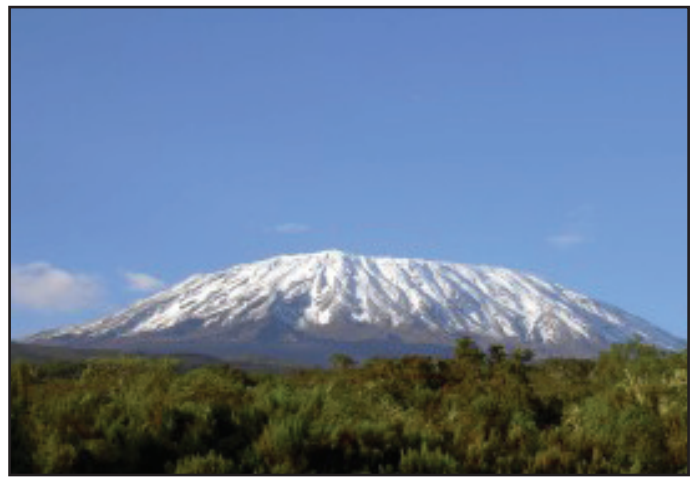
The imposing snow-capped peak of Mt Kilimanjaro in Tanzania will be the focus for brave PCFA fundraisers.

This is a major undertaking for any interested parties, as participants pay for their trip and also have to raise