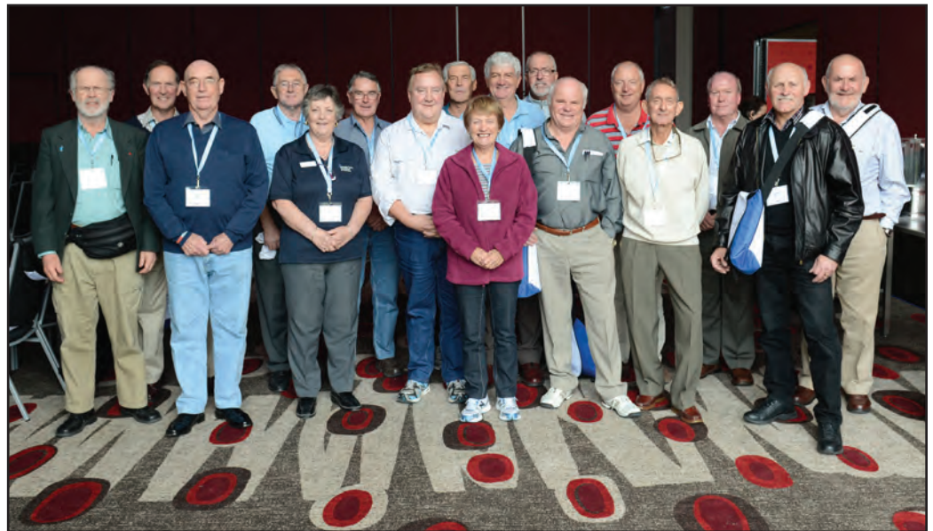
ABOVE: Most of the Central Australia Chapter delegates at the PCFA training conference in Melbourne during May.

Still, if it's true that pictures are supposed to be worth a thousand words, then an awful lot of information was given to the audience! There is an album of 192 photos from this event that has been posted