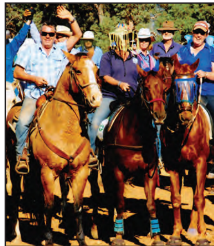
ABOVE and LEFT: The northern Flinders Ranges in South Australia became dotted with blue-clad horses and riders in support of prostate cancer awareness during the 2013 Travellin' Ten Trail Ride.